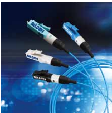
Accessories for the MIPP™ Fiber Splice Box Brilliance connectors