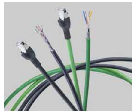
Accessories for the MIPP™ Copper Patch Panel DataTuff® for cables and patch cords

MIPP™ Copper Patch Panel is UL certified (UL 1863).