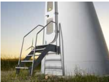
Wind tower installation application